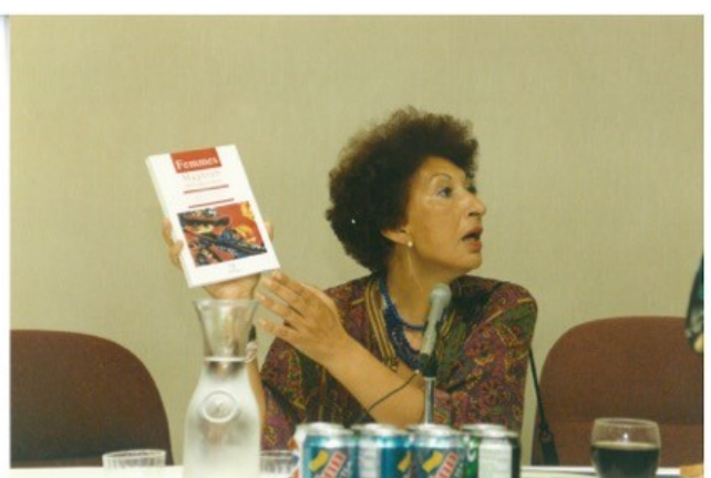
Photo taken at the Sisterhood Is Global Institute Conference at American University in 1994 titled "Religion, Culture, and Women's Rights in the Muslim World".

Association for Middle East Women's Studies